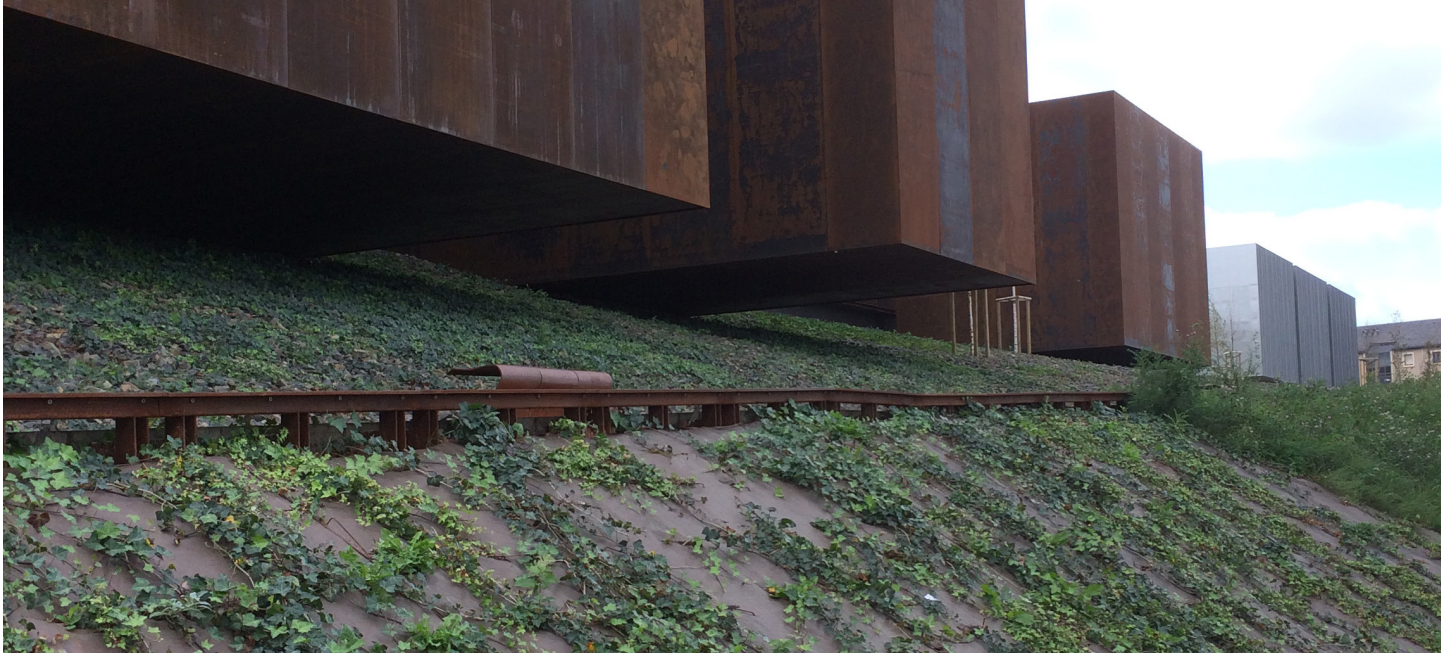
The park around Museum Pierre Soulages.

The Pierre Soulages Museum, initiated by the urban community of Grand Rodez, opened its doors on 31 May 2014. Built to exhibit the works of the famous painter, it will also be used to hold numerous temporary exhibitions to showcase other contemporary artists.