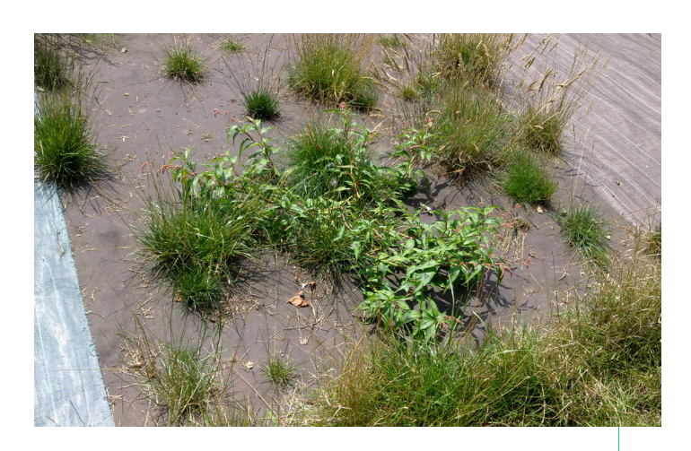
3. July 2011: the non woven has completely disappeared.