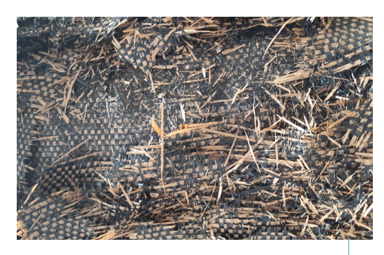
Degraded Duracover after greenhouse test

To give Duracover the high humidity and high temperature it needs to degrade, a test roll packed in film was put in a greenhouse. After being exposed to high temperatures and humidity for 2 months, Duracover was degraded to microfragments. Over time, the fabric would continue to compost untill it dissapears.