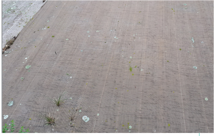
4 August 2018: Duracover is still in a perfect shape