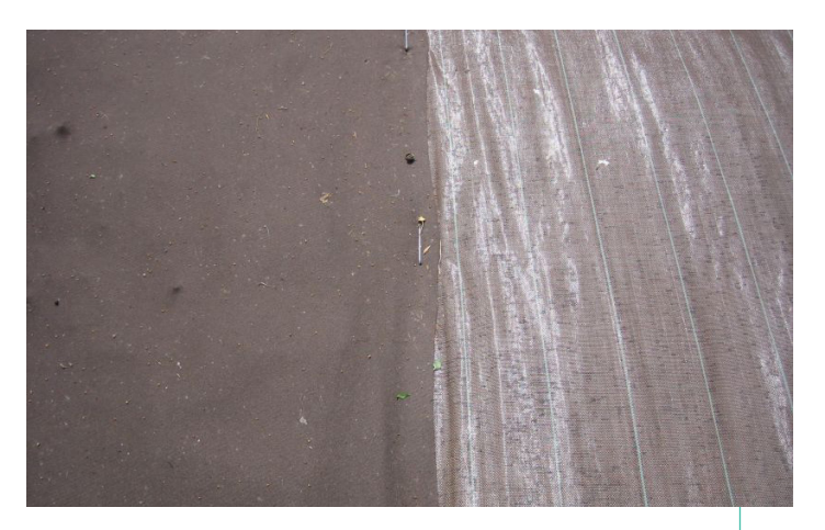
1. June 2010: moment of installation

In July 2011, the non woven was in such a bad shape, that it was no longer considered a part of the test. In 2018, Duracover is still perfectly functioning.