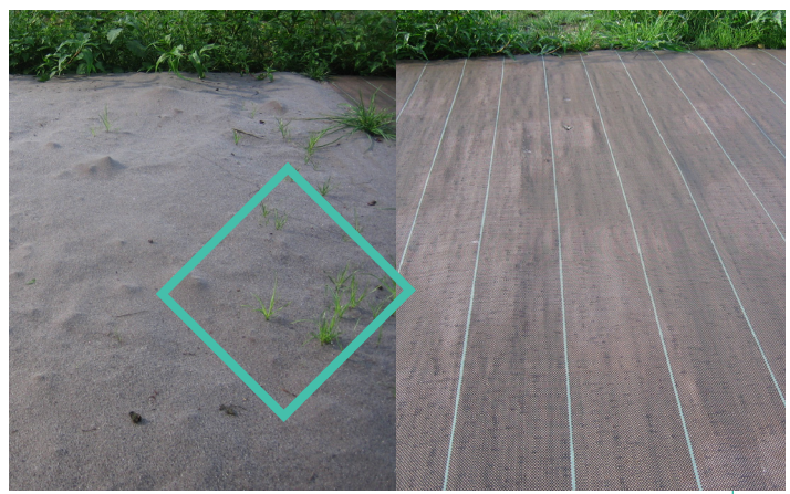
2. August 2010. The non woven is already degrading